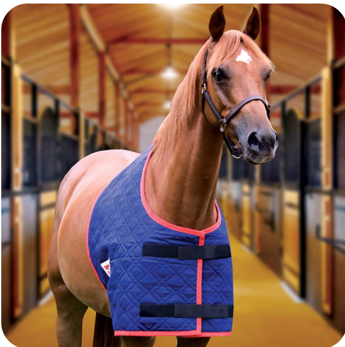
Rip Stop Cotton Quilted | Pony / Horse