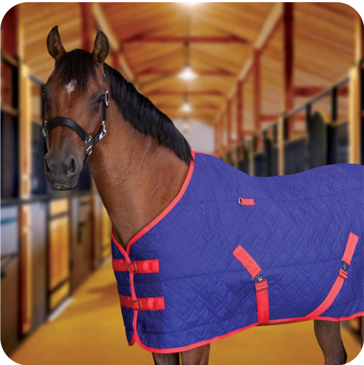
Rip Stop Cotton Quilted | 3'0 ~ 7'0