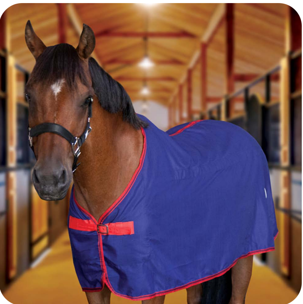
Rip Stop 5' - 70