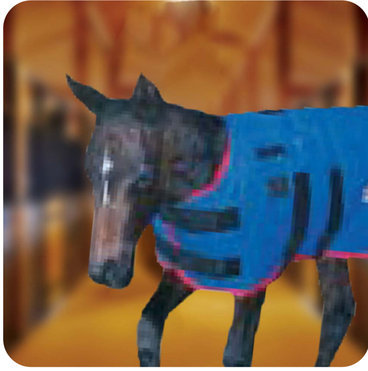
Adjustable canvas rug and under-rug, plus 4 leg wraps