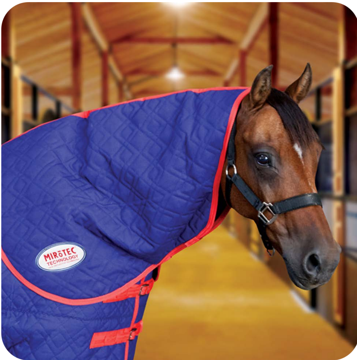
Rip Stop Cotton Quilted | Pony / Horse