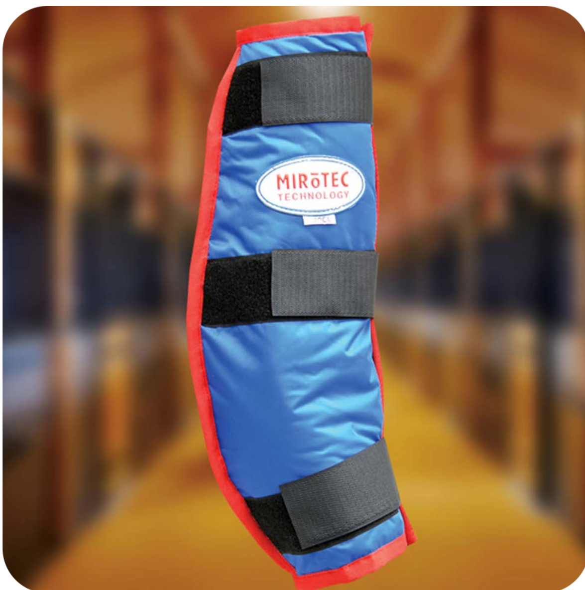
Canvas Pony / Horse