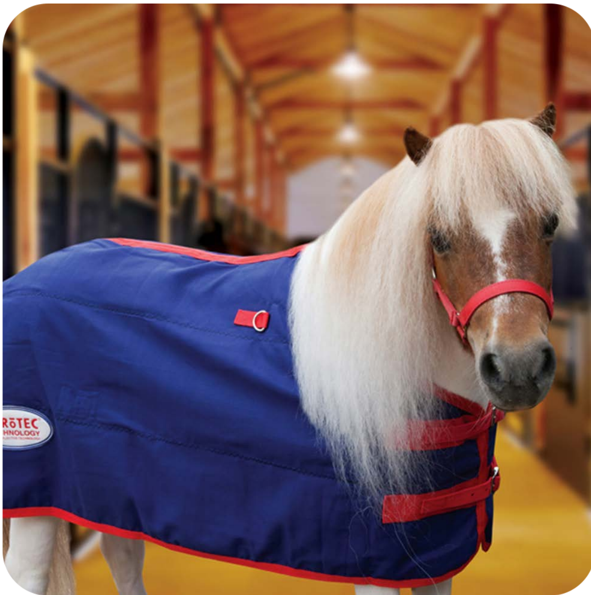
Rip Stop Cotton 3'0 ~ 7'0