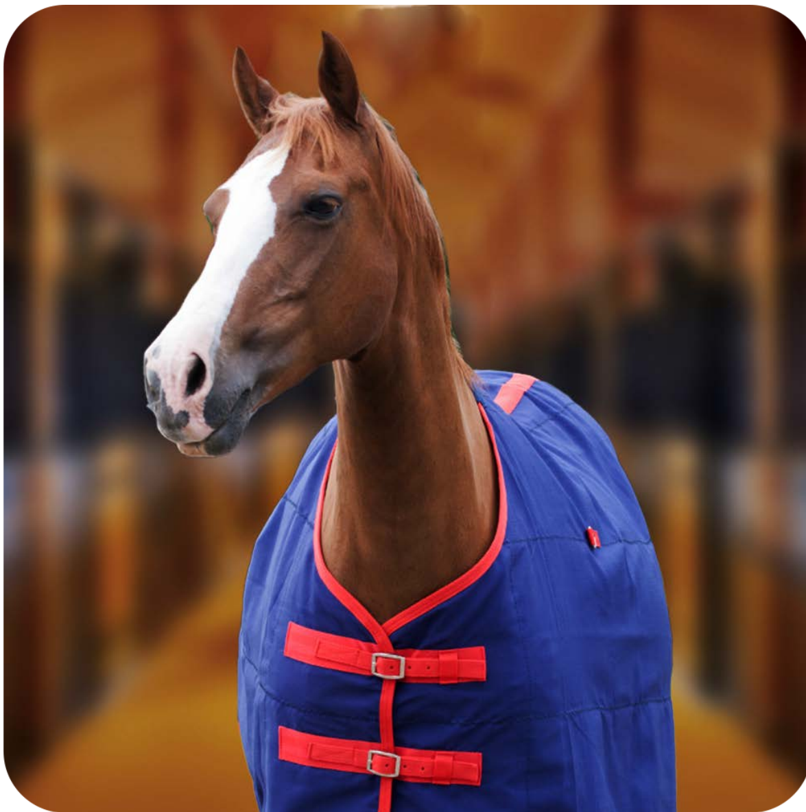
Rip Stop Cotton 3'0 ~ 7'0