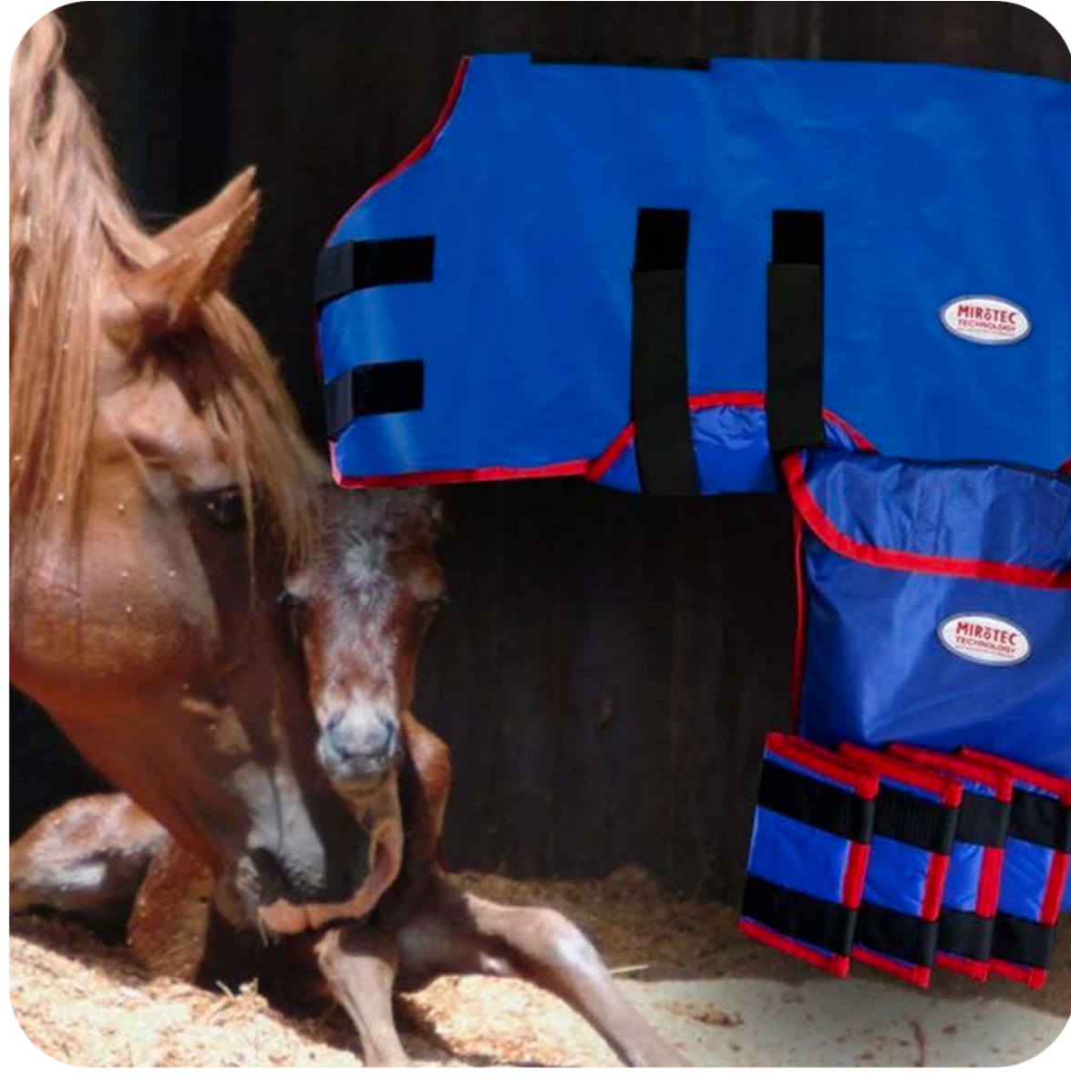
Adjustable canvas rug and under-rug, plus 4 leg wraps